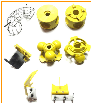
Small Pressing Kit for lemons/limes