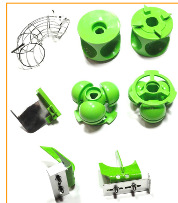
Large Pressing Kit for grapefruit